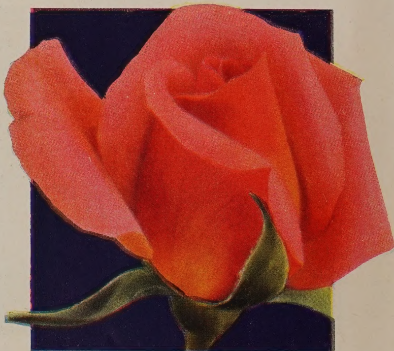
R. M. S. QUEEN MARY—$1.25 each; 3 for $3.15 (Patent 249)